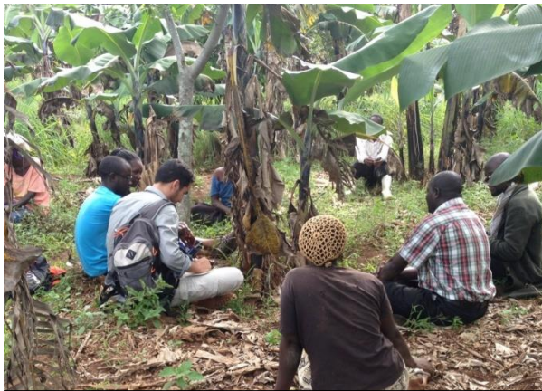
Above: PhD students in Rakai Working with Communities

With financial support from Carnegie Cooperation of New York, RUFORUM supported the joint implementation of field based module on Participatory Methods and Action Research for innovation in livelihoods and agricultural systems offered under the PhD Agricultural and Rural Innovations (ARI). This module is unique in delivery as it brings together students from the three universities in Africa and three universities in Europe to a Common facility. This year's field training took place in Rakai District in Uganda. A total of 18 students and five academic staff from the consortium spent two weeks in the field to learn together with farming communities. The students were from Africa (DRC, Ethiopia, Ghana, Nigeria, Rwanda, Tanzania, and Uganda); Europe (France and Spain); and Latin America (Guatemala). Female participants represented 31.6%. The diversity of students and staff was a learning resource that enabled substantial cross learning and complementarity of skills.